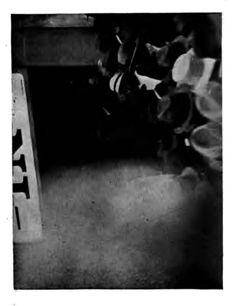
"Absolutely mystifying" is his description. CURIOUS PHOTOGRAPHIC EFFECT REFERRED TO IN THE TEXT.